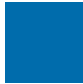
PMS 301C C100 M43 Y0 K18